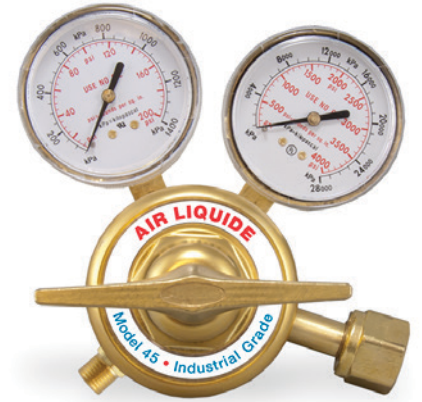
Recommended for use with FLAMAL™ and all types of welding gases